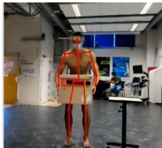
Figure 1. Left. Marker-less gait capture in Bicêtre Hospital (Le Kremlin-Bicêtre). Right. Marker-less handling motion capture in lab environment.